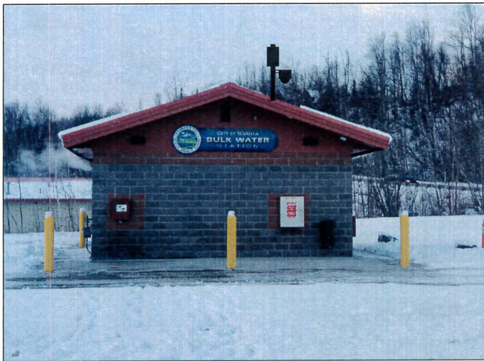
① Location 1 Water Distribution