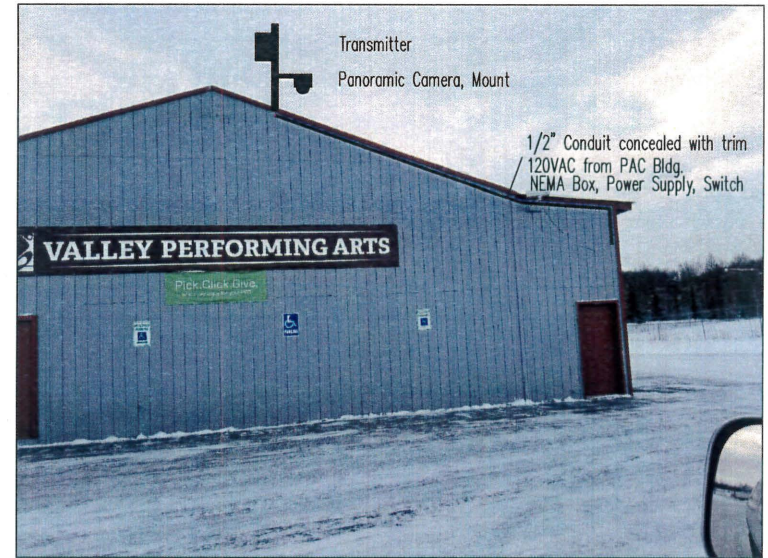
4 S-2 Location 6 Parking Lot East Park Performing Arts Center