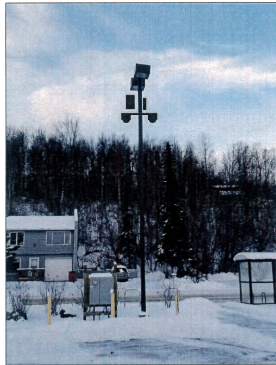
② Location 2/3 Parking Lot North Park