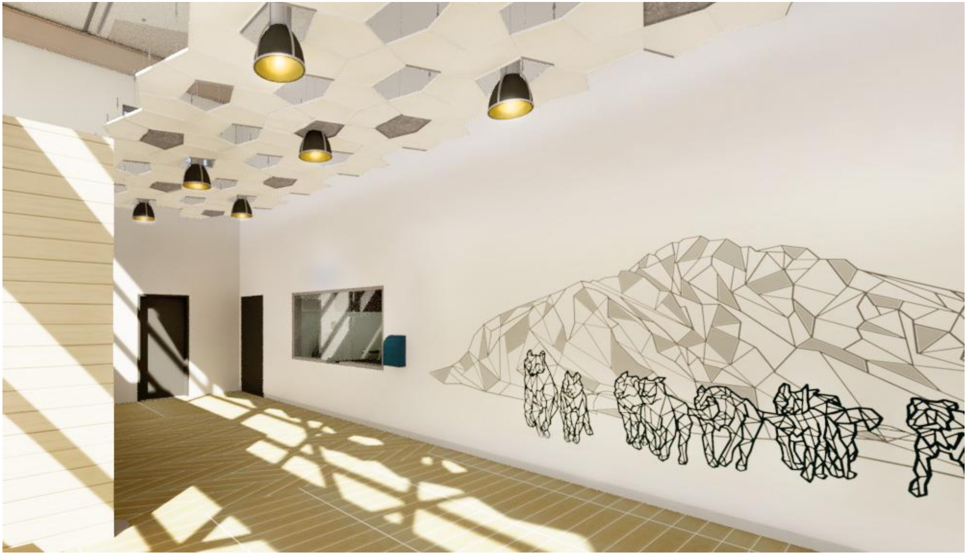
LOBBY RECEPTION WINDOW